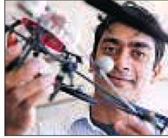
■ A prototype of the robot

Currently the challenge is that aerial robots cannot fly in obstacle-rich environments, and they crash, he said. “This is because humans cannot react fast enough to save it from